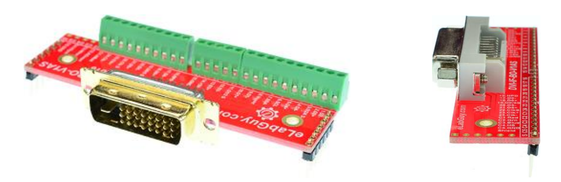
Figure 3: DVI-DM-BO-V1AS various connections