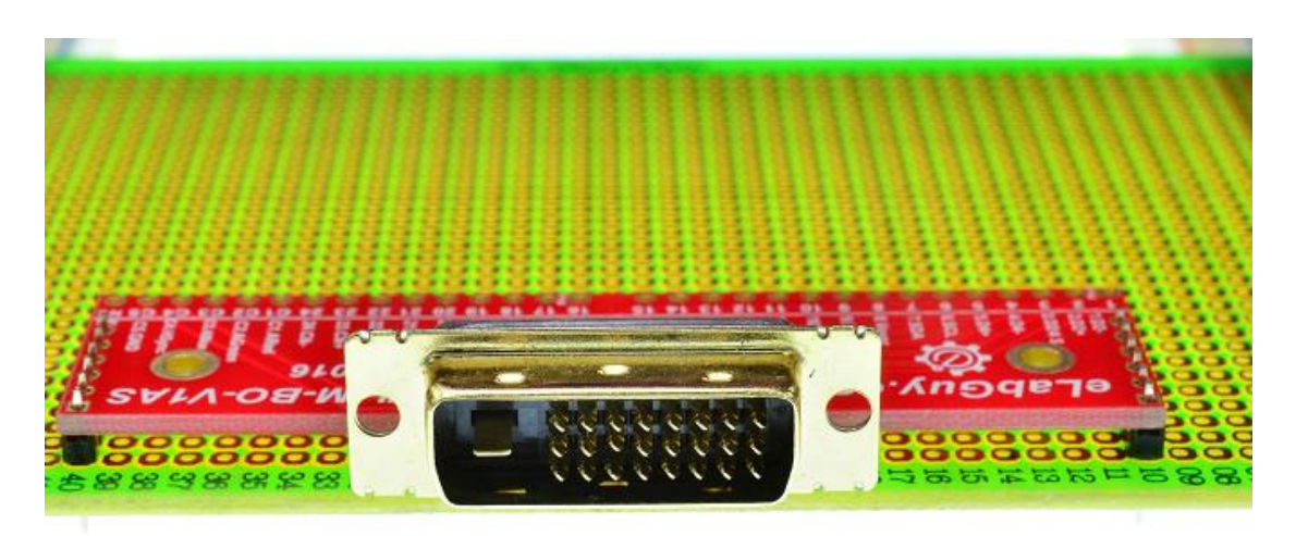
Figure 4: Solid Mounting on prototype PCB